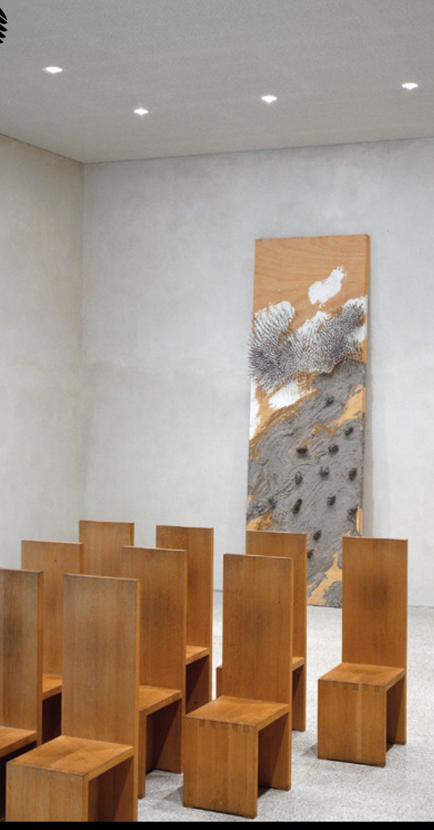
Art at the German Bundestag Günther Uecker