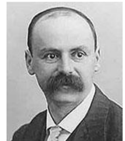
Karl Schwarzschild 1873-1916